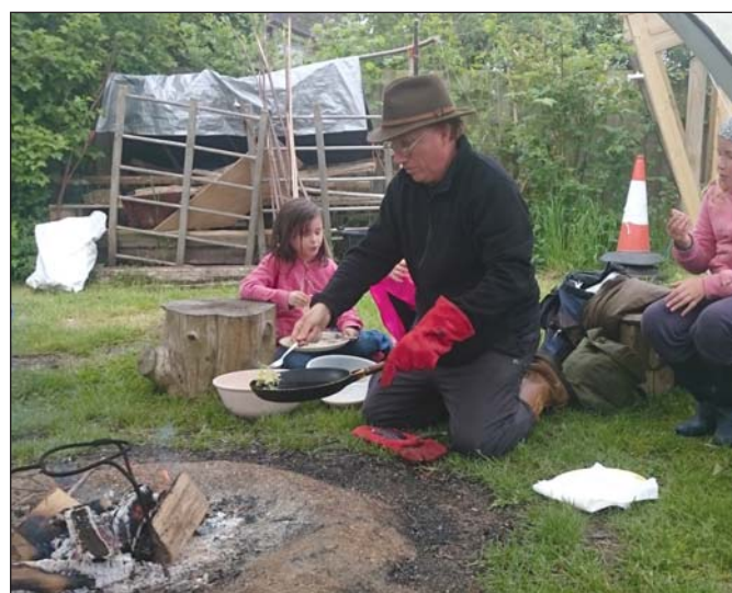
Battered elderflowers at our Plant Share in 2016