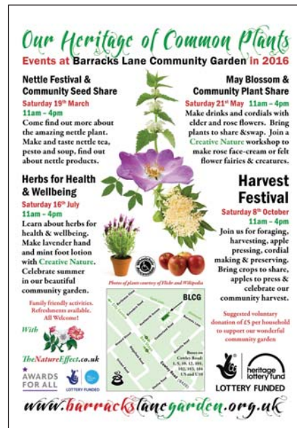
Posters promoting some of our recent events

Increasingly people find out about events through social media and our facebook exposer has grown steadily over the past year. The trustees believe that it is important to continue to put out printed material (flyers and leaflets) to help people without use of the internet to access the garden. Stig continues to work with us to design material for print and web use and we thank him for his vision, creatively and patience!