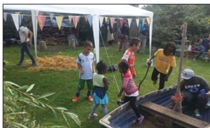
Children play at our Summer Party

The garden is used by a large number of individuals for their own private events, parties and functions. Groups and organizations from the local community regularly use the garden for their different activities. We have worked steadily to maintain these relations and to foster new ones. A full list of groups that have used the garden this year and partners we have work with are in annex 2.