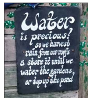
A set of new hand-painted slate signs help visitors navigate around the garden