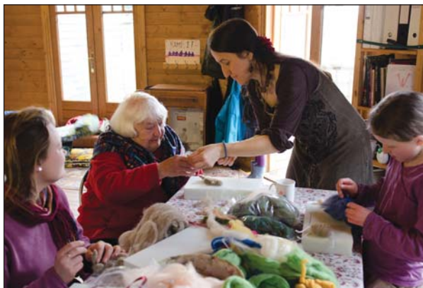
Felt making workshop in March 2016 at BLCG

This year has been another very challenging and successful one with the majority of our commitments and expectations met. The Garden has continued to develop and thrive, with a whole host of new activities running alongside regular user-groups and many new visitors discovering the garden for the first time.