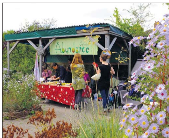
Working with Abundance