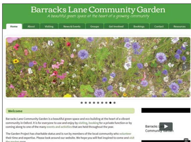
The homepage of the Barracks Lane Community Garden website